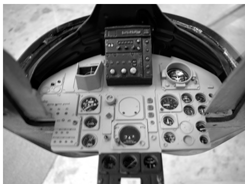
Forward Instrument Panel