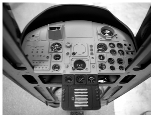
Rear Instrument Panel